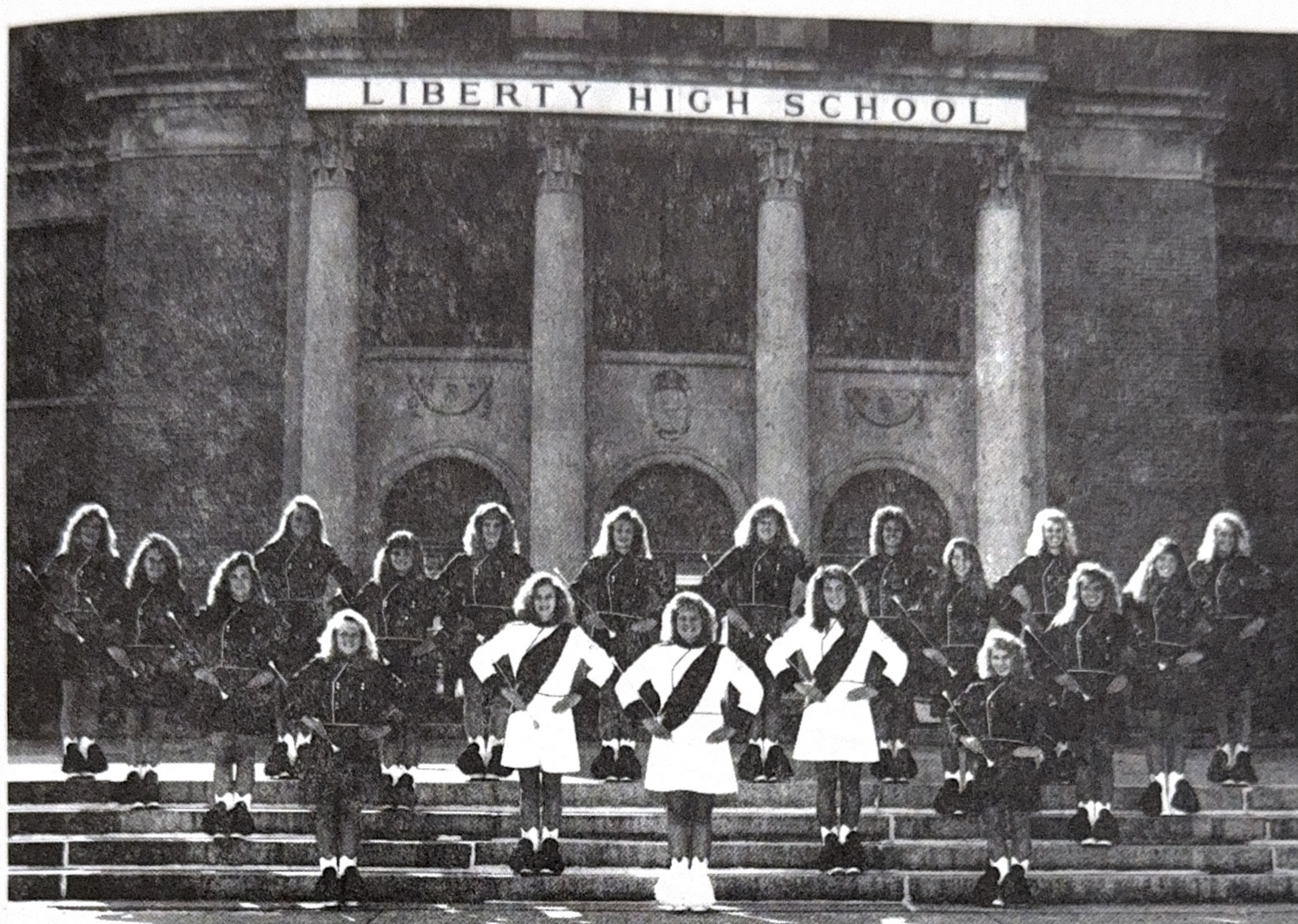
L.H.S.G.B. MAJORETTES AND TWIRLERS