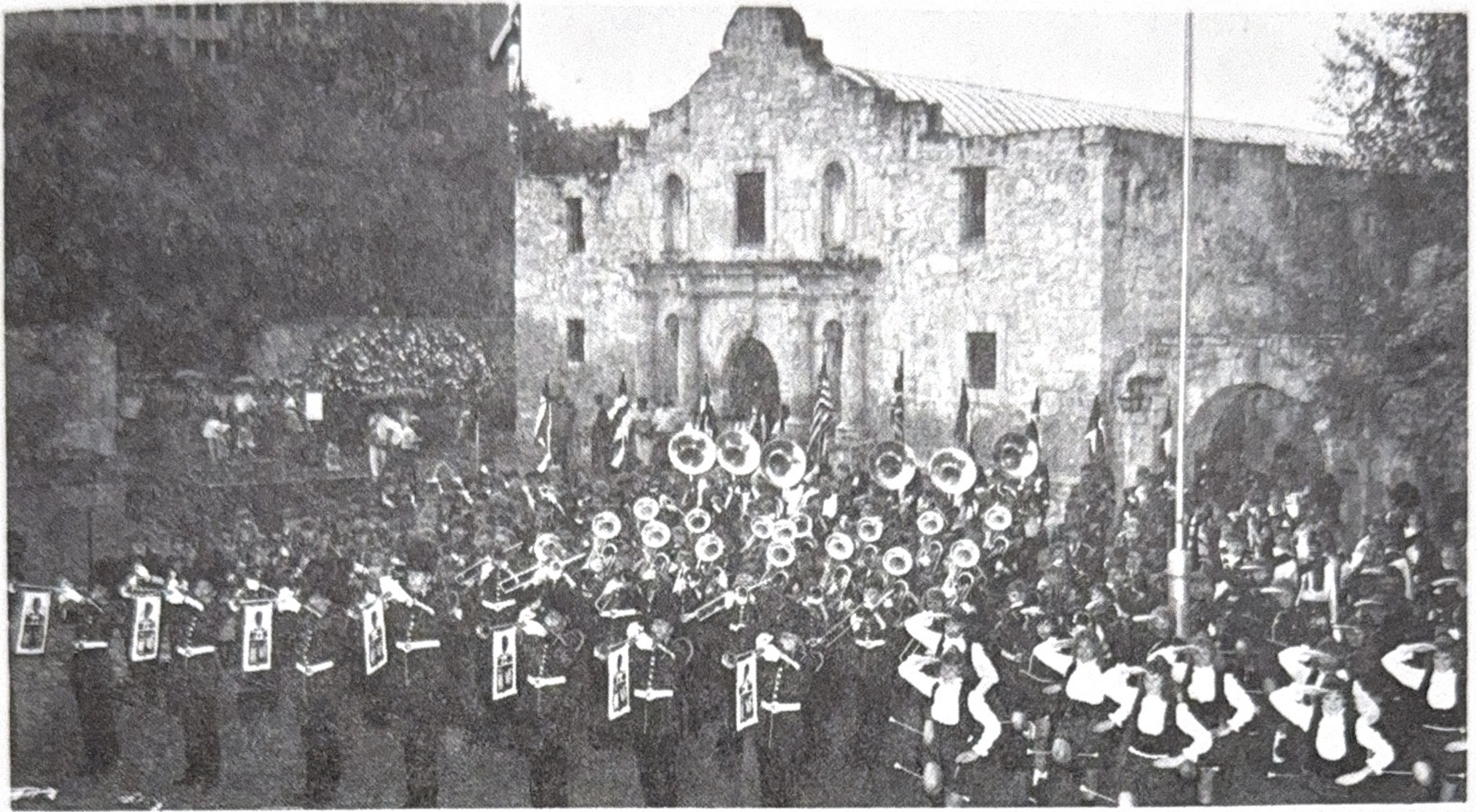
L.H.S.G.B. at "THE ALAMO" — San Antonio, Texas — April 16, 1988